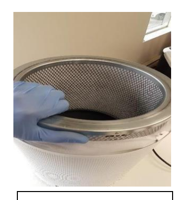
6. REMOVE THE CARBON FILTER BY FIRMLY PULLING IT OUT. THE PREFILTER IS HOLDING ON THE CARBON FILTER SO YOU HAVE TO OSCILATE THE MOVMENTS WITH BOTH HANDS IN ORDER TO RELEASE IT.