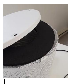
3. REMOVE THE BOTTOM COVER AND THE FOAM GASKET