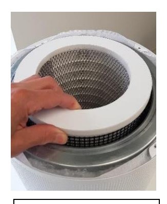
5. REMOVE THE HEPA FILTER