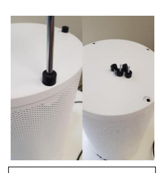
4. USING A SCREWDRIVER REMOVE THE 4 SCREWS